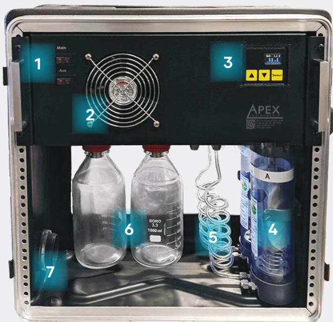
3. Temperature Control